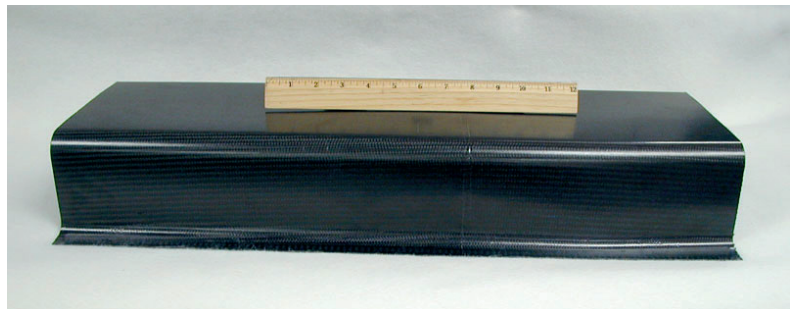
Demonstration part of 100+ plies of TC275-1, with less than 1% voids.